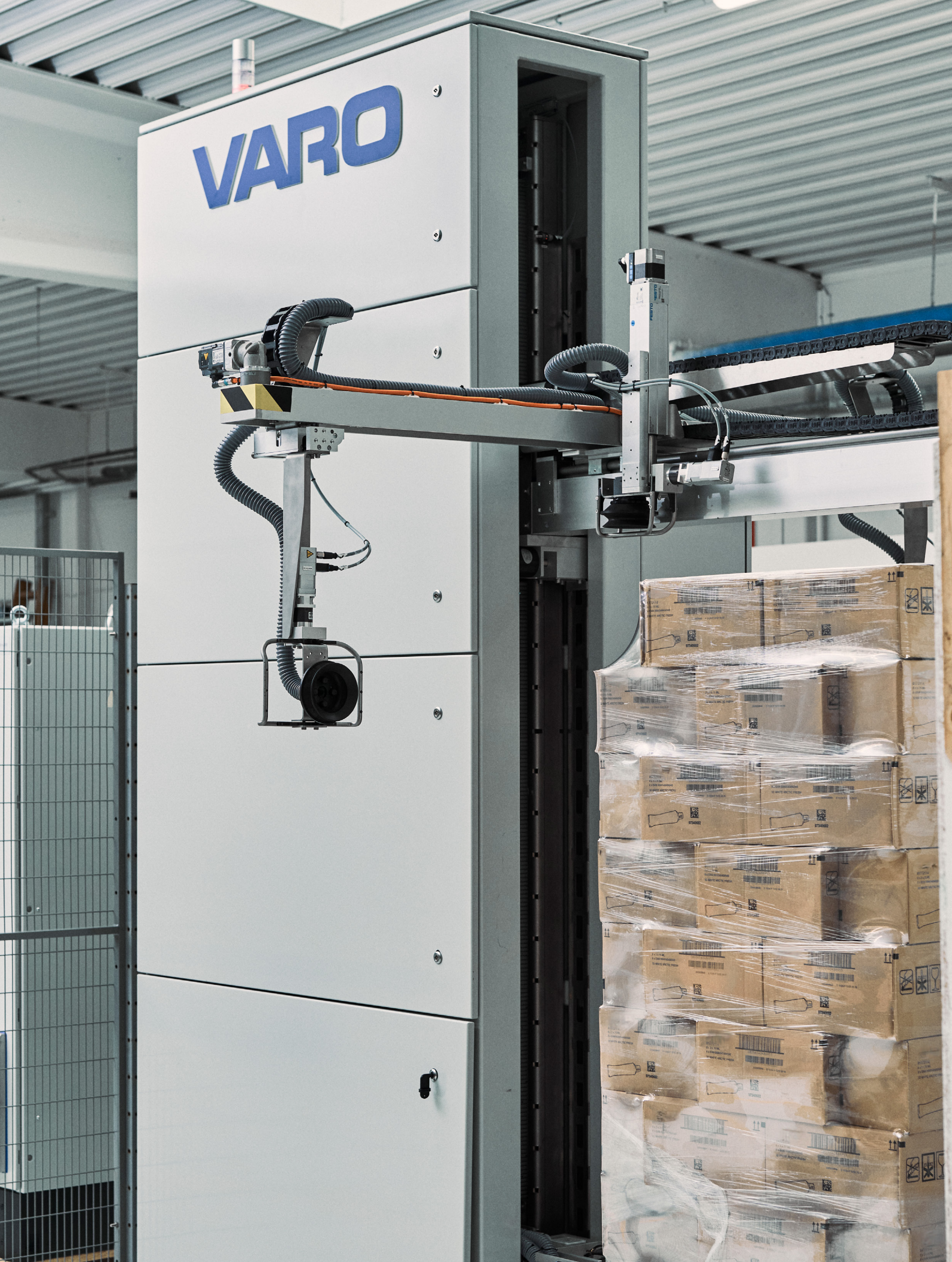
VARO Unwrapper Core at our test center in Denmark